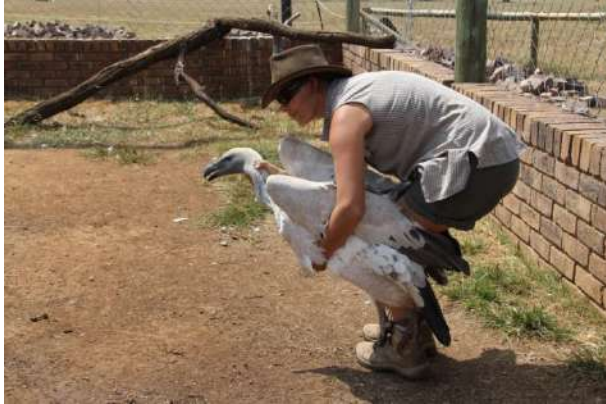
Figure 14: Preparing to release the vulture. The handler is going onto her haunches to bring the vulture to ground level.