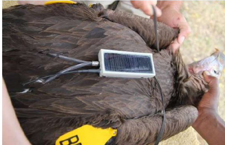
Figure 30: Tracking device placed centrally between the shoulders and just below the ruff feathers.

Holding the device in place, take the harness straps down the bird's back and then separate the two straps to between the insides of the bird's legs. You will need one person holding each leg in each hand in order to open the legs apart to be able to correctly place the harness between the legs. The bird's legs should be held backwards towards the person holding the legs. Take both the harness straps up the sternum and then around and inside each collar bone. If using the thin tubing, you can directly thread the Teflon® with tubing through the centre of the tracking device's attachment point, coming from the top sides of the device and tie a loose knot at this central point in order to allow adjustments to the harness. This entire initial process is done with the bird placed on its sternum.