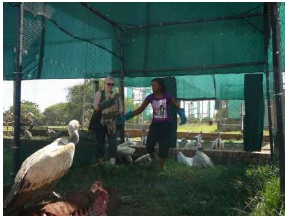
Figure 9: Two handlers calmly approach a vulture.

measuring 1.5 x 0.7m will suffice. It allows easy access from all sides for the team to work on the bird. Catching and handling vultures may result in serious and sometimes permanent injuries in the absence of proper equipment, care and training.