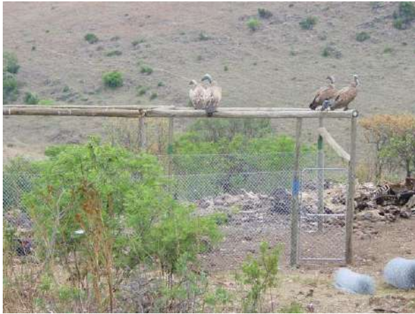
Figure 5: Vultures resting on top of capture enclosure, demonstrating the need to remove sharp mesh edges on all sides of the enclosure.

There should be no sharp points on the inside, outside, or top of the enclosure, to avoid causing harm to the birds. A captured vulture may be harmed through panic and trying to escape by running and brushing the enclosure sides in the hope of finding a gap. Vultures will walk on the outside of the enclosure, sometimes brushing the sides. Free vultures may also alight on the top, using the capture enclosure as a perching and roosting spot (fig 5).