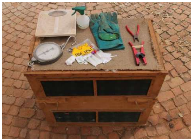
Figure 8: A vulture crate used as a processing table. The work space has been covered in a soft carpet and displays the necessary tagging tools and personal protection gear.