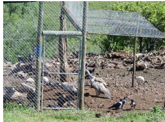
Figure 2: Vultures are entering the walk-in trap. The curtain is pulled to the side while the diamond mesh door is raised. The pedestrian gate is closed.

The capture enclosure should be built with 40/50mm diamond mesh, also known as chain link. Do not use welded mesh, as this material is more rigid than diamond mesh and will cause trauma to the birds if they collide with it. The mesh must have a wire thickness of 2mm or more. Thinner wire will cut the birds' skin. A pedestrian gate (fig 1 and 2) needs to be installed and half of the roof should be covered with at least 70% shade netting to avoid excessive heat exposure. The sides of the enclosure should have shade netting rolled up on the outside. The shade netting should be rolled down once the vultures have been captured, providing more shade, creating a 'safer' and cooler environment for the birds, reducing their stress (fig 3). The use of large heavy poles around the inside perimeter of the floor of the enclosure to attach the mesh will reduce wire injuries to the vultures' heads and also prevent birds being exposed to the wire ends where the mesh reaches the ground (fig 4).