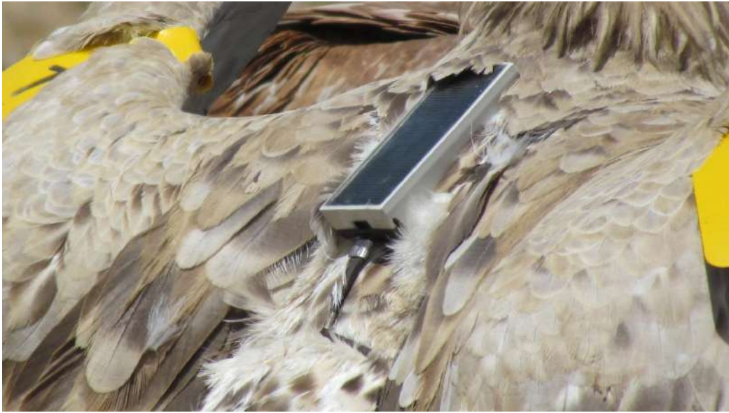
Figure 35: A juvenile Cape Vulture displaying a GPS-GSM tracking device attached via a Teflon® backpack harness.