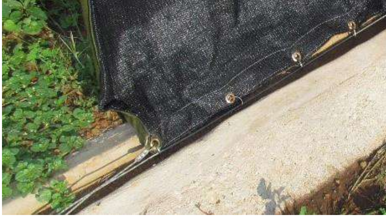
Figure 7: Cement groove with the lower guide cable running inside. The curtain is attached to the lower guide cable via split rings and is being pulled open.