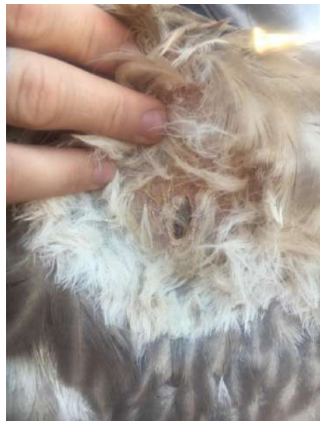
Figure 25: The resulting hole in a young bird's patagium, resulting from the bird being tagged when it was too young.

In no circumstance should a bird be tagged before primary feathers are fully developed and the bird is stretching its wings in preparations for its first flight. This is around 4 months old in the case of Gyps species and large vultures. Smaller vultures need to be assessed from 3 months onwards. A developing bird's skin will stretch and the piercing created by a patagial tag, if placed when the bird is too young, will expand leaving a gaping hole (fig 25).