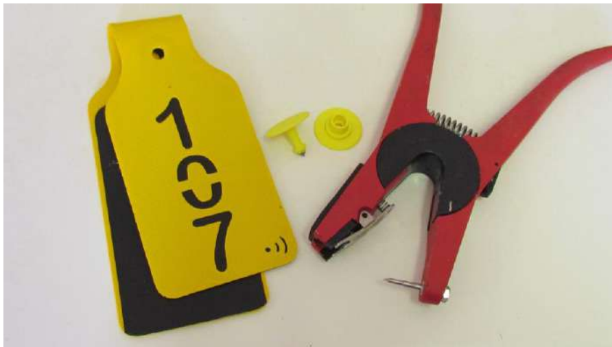
Figure 22: GYPAETUS model tag with male and female attachments, ALLFLEX applicator

Most tags use a male and female ALLFLEX attachment (similar to the cattle ear tags) which are easy to implement with a hand-held applicator (fig 22).