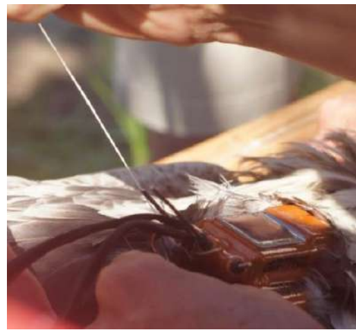
Figure 33: Sewing through the two twist square knot with dental tape.