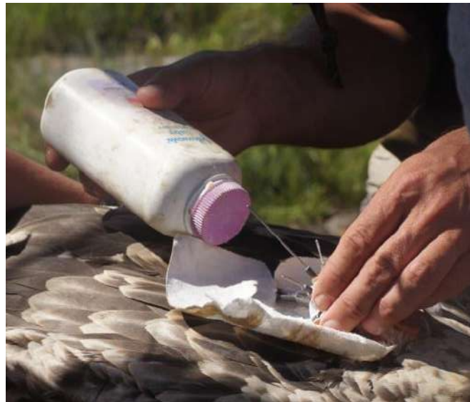
Figure 34: Cardboard is placed under the knot while glue and baby powder are applied.

Place a piece of thick paper or cardboard under the device and super glue the ends and knots all together while pressing the knot into the desired position flat on the device. The paper/cardboard is used to prevent the glue and the device from sticking to the feathers. Finally, complete the process by covering the knot with epoxy. Baby powder can be used over the epoxy to speed up the drying process (fig 34). Glue needs to be tack dry before release, and the powder will dehydrate the surface of the glue while the inside is still setting. Remove the piece of paper/cardboard before releasing the bird, but avoid pulling it off with the glue as well. Pull it off gently or cut around the paper leaving a tiny piece stuck to the device which will, with time, disintegrate.