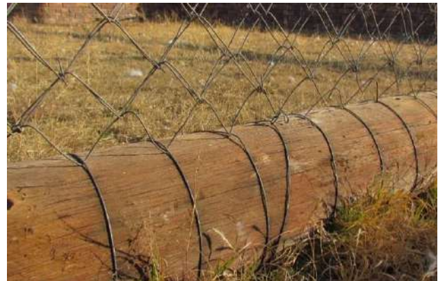
Figure 4: The inside floor of the mass capture enclosure: Diamond mesh is attached to a pole on the ground using wires, eliminating stray sharp points.