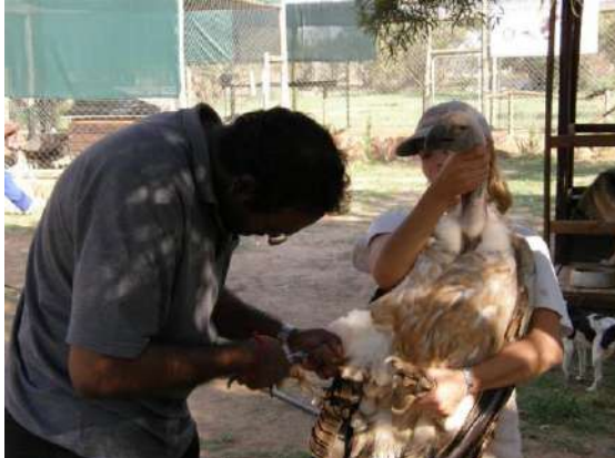
Figure 19: One person secures the bird's body and head while another person holds one leg and takes the blood sample

Drawing blood from vultures should only be done after proper training, and practice in a controlled environment under veterinary supervision, and always with the proper ethics clearance and required permits.