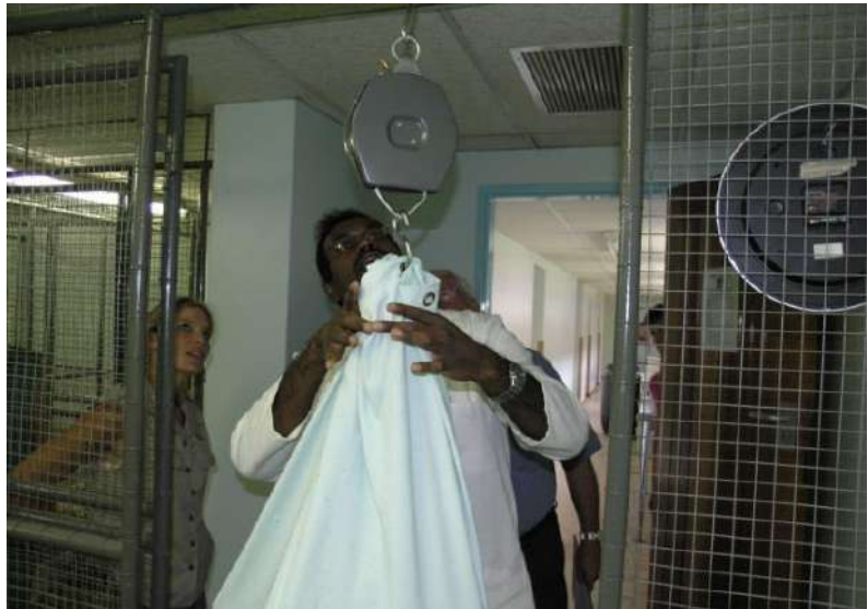
Figure 21: Weighing a vulture on a hanging scale. The bird is secure in a durable cotton bag. Loops on the top of the bag are inserted into the scale hook.

Weighing the vulture on its own is more accurate than the stand-on method. It is necessary to use a scale large enough so that the majority of the body, i.e., the heaviest parts such as the chest and head, make contact with the centre of the scale. The bird must remain still long enough for the scale to settle on a single value.