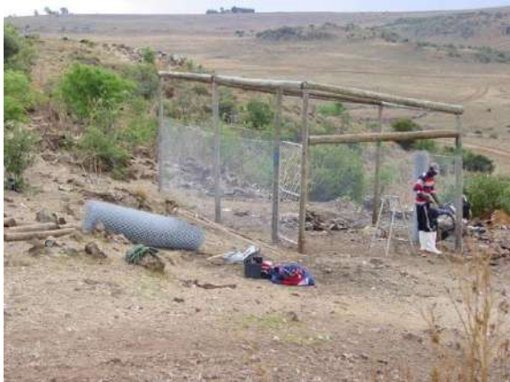
Figure 1: Walk-in trap during construction. The pedestrian gate has been installed.

A comfortably sized capture enclosure to hold fifty Gyps vultures should measure 15m long x 5m wide x 3m high.