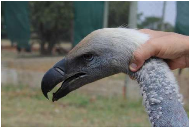
Figure 10 (above): The proper hand placement to stabilize a vulture head.