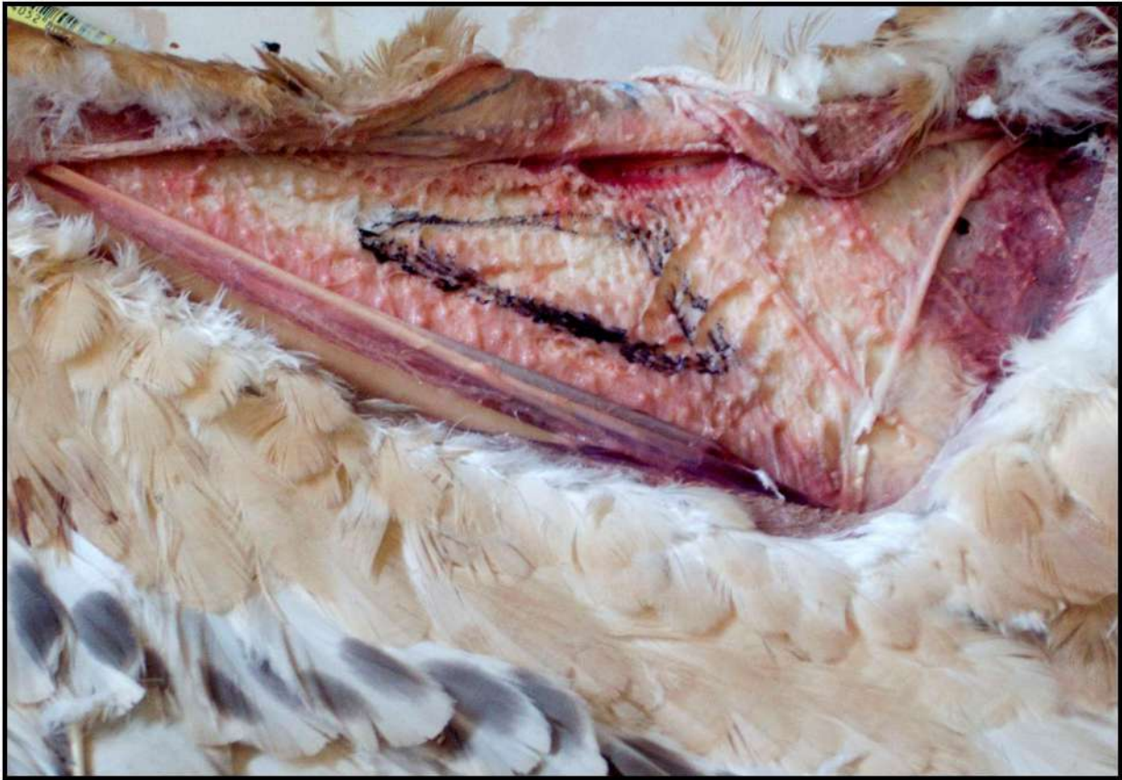
Figure 23: Sternal view of the Internal anatomy of a Cape Vulture's right wing with several tendons, ligaments, bone, and the patagium clearly visible. The elbow joint is in the bottom right corner and leading edge of the wing is at the top of the frame.

Below is a series of photographs of a vulture's internal wing anatomy (fig 23 and 24). These highlight several vital ligaments and tendons within the patagium in red. The 'safe zone' for the placement of tags is highlighted in black (fig 24). The distances mentioned above and figures below guide the placement of patagial tags, and are critical to allow space for the tags to avoid contact with all ligaments, tendons and bones.