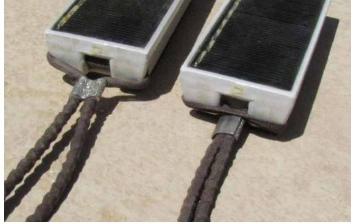
Figure 28 (left): The solar-powered GPS unit is ready to be fitted to a vulture. Silicone tubing, sheathed in Teflon® tape, is threaded through the unit. Silicone tubing is exposed on either end, lengths are symmetrical.