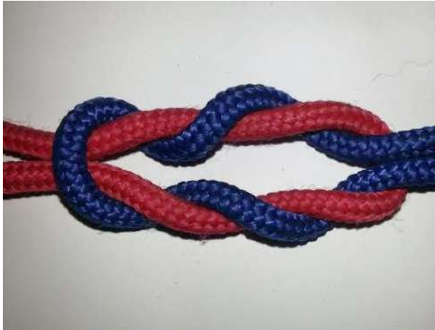
Figure 32: Completed two twist square knot.

Turn the bird again carefully over back onto its sternum. Now run both your hands on each strap and double-check that the harness is placed correctly inside each of the collar bones and that it has not popped out and is sitting on the bird's shoulders. Check this a few times to be on the safe side. Check symmetry and harness tension. It should now be tight, and you should be able to fit two fingers under the straps between the lower end of the device and the tail crimp. Any looser and there is a risk of the bird getting its head stuck under the straps. Once you are satisfied with the tension and symmetry, close the crimps on the rump and sternum. You will need to turn the bird over and back one last time to do this.