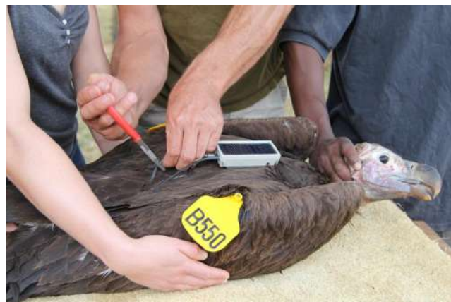
Figure 31: Fixing the tail bone crimp in place. The crimp is not fully tightened at this stage. It should be able to move slightly for adjustment.

Check that the device is still correctly in place, i.e. in the collarbones. Lightly crimp one metal ring around the harness straps, joining the two together, leading from the device towards the tail, just above the base of the tail bone (fig 31). It is at this point where the tightness of the harness is measured. Make sure at all times that two fingers above one another can be placed, at an angle, between the bird and the harness at this exact point. Do not crimp the ring tight just yet as the harness still needs to be adjusted for a perfect fit. At this point, the metal crimp should be able to move up or down along the harness material for adjustment purposes. Tighten this crimp at the