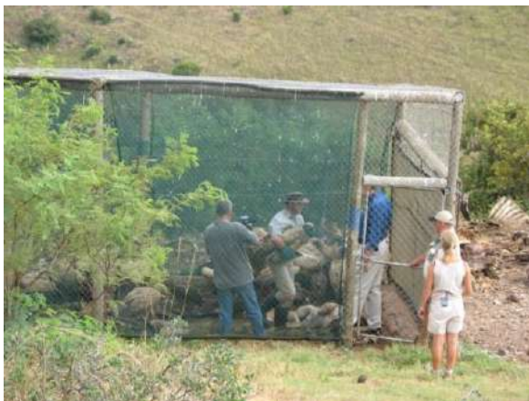
Figure 3: Handlers remove a vulture from the enclosure while team members help open/close the pedestrian gate. Curtain and shade netting are fully extended whenever vultures are in the enclosure.

The pedestrian gate is used to enter and leave the closed capture enclosure without interfering with the curtain. A colleague should always watch and help open and close the gate behind the researcher entering the enclosure, to avoid escape by any vultures (fig 3)