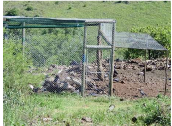
Figure 6: Ready for captures. Shade netting is rolled up in the closed position on the side of the enclosure. The curtain is pulled open and diamond mesh door is raised, allowing vultures to enter.