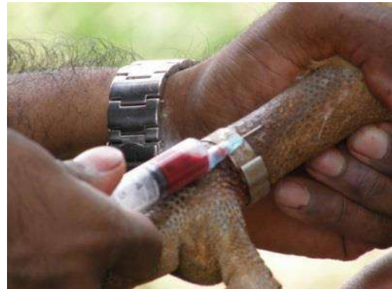
Figure 18: Drawing blood samples from the tarsus vein. The procedure requires only two people.

Vultures should always be held vertically, as this is more comfortable for the bird. The tarsus vein in the leg is the easiest location for drawing blood; the procedure requires just two people (fig 18). The tarsus vein is also preferred as it is less likely to blow or collapse as wing veins often do. Make sure your needle is the correct diameter for the species. A 23-gauge 1 inch needle works well for most species. VulPro has processed large Gyps species with this size as well as the smaller Hooded and Egyptian vultures. Shorter needles are easier than long ones. Slightly bend the needle before drawing blood to avoid going directly through the vein as the veins are right against the surface of the skin. One person should hold the bird according to the methods described above, while the other person should hold one leg and draw from the vein (fig 19).