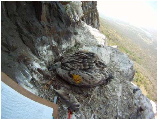
Figure 16 (above): Processing a nestling on a cliff.