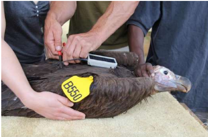
Figure 13: A vulture being processed on its sternum. Each team member secures a body part while a separate member processes the vulture. One team member holds the head, another secures the feet, while another secures the wings.

Never tape or tie the beak closed under any circumstances. Vultures often regurgitate in defence or through stress and they need to be able to rid themselves of this. If their beak is taped closed they can choke on their own regurgitation. During regurgitation, the person holding the head should simply tilt the head to the side and allow the bird to regurgitate freely. Never close the beak when a bird tries to regurgitate as this will lead to choking which can be fatal. Placement of the bird on the table / crate should ideally be with the head over one side of the table so that the head can be tilted to one side and slightly below the level of the table, allowing regurgitation to land on the floor rather than on the workspace. It is a