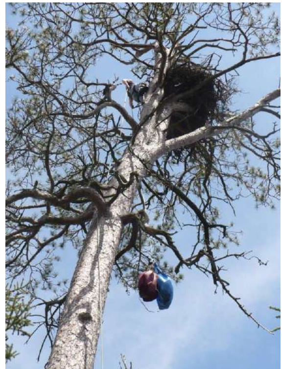
Figure 17 (right): Chicks are being hoisted up in secure bags to the handler at the nest.