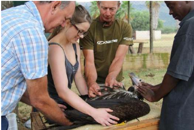
Figure 12: A vulture being processed on its back. Each team member secures a body part while a separate member processes the vulture. One team member holds the head, another secures the feet, while another secures the wings.

When working with a bird on a table, you can either place the bird on its sternum or back, depending on what you are doing, but usually the bird is placed on its back to start. For this type of vulture processing, you need three to four people to work on the bird and under no circumstances should the bird be tied, taped or bound in any way. This is unnecessary and can cause injury to the bird. One person holds the head (see above on how to hold the head), another person holds both legs and the third person secures and holds the wings against the bird's body (fig 12). In the case that you want to stretch out the bird's wing, the fourth person can do this while the third person keeps the bent wing secure. The person holding the legs should hold one leg in each hand or should at least