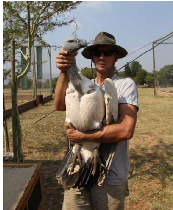
Figure 11 (right): The proper way to hold a large vulture. The head is secured in one hand while the body, wings, and feet are restrained by 'hugging' the vulture.