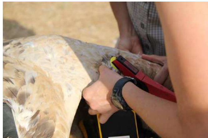
Figure 26 (left): patagial tag appropriately placed distal to the elbow so it does not interfere with the bend in the patagium.