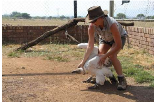
Figure 15: Releasing a vulture. Release the head and body simultaneously and step back slowly, allowing the vulture to decide where to move next.

When releasing a vulture go down on your haunches (fig 14), slowly allow the bird to stand, then release your grip on his entire body and neck at the same time, stepping away to give the bird some space (fig 15). Be careful not to drop or throw the bird down, nor allow the bird to fall before placing it down gently to the ground. When releasing the bird or placing it back inside the enclosure, remain still and allow the bird to walk or fly away from you. Do not force the bird to move. Allow the bird time to recover but monitor it for any unusual behaviour that could be a sign of heat exhaustion or injury from handling. The bird will decide for itself what to do next; it might fly off, run or drink water. Never force the bird to move or fly after the handling, simply monitor and interfere only as a last resort if the bird appears not to be fit for release.