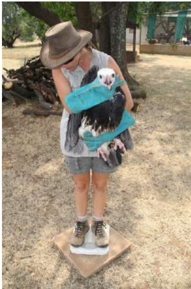
Figure 20: Weighing a vulture on a stand-on scale while on a secure, level surface.