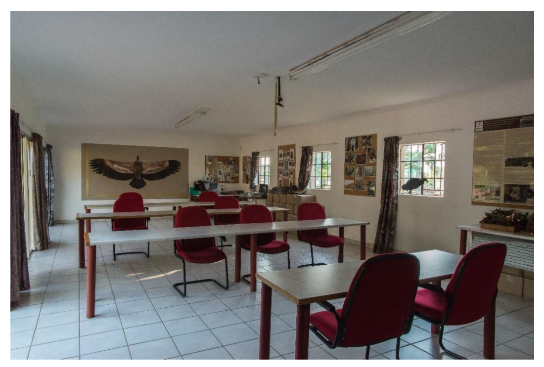
Figure 2: VulPro's educational centre.