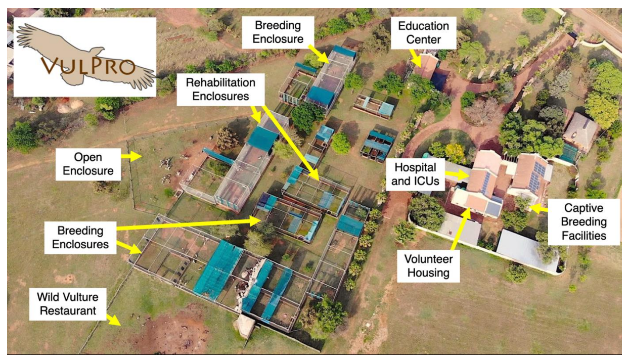
Figure 4: Aerial view of VulPro's facilities.