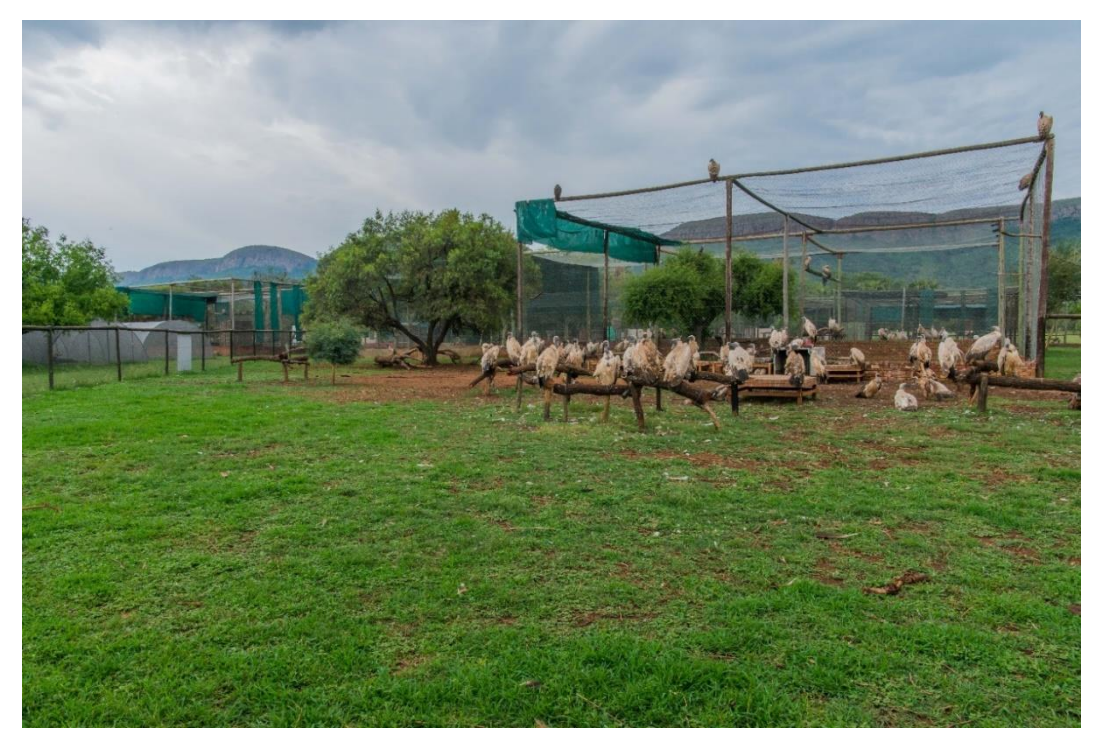
Figure 3: VulPro's open enclosure. Notice the wild vultures sitting atop other enclosures surrounding the open enclosure.