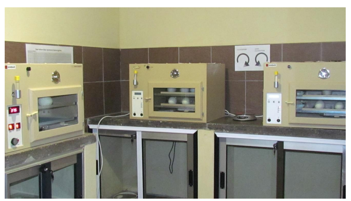
Figure 6 : VulPro's incubation facilities housing Cape Vulture eggs.

VulPro continues to inspire students across the region and internationally, as witnessed by the increasing number of academics approaching VulPro interested in vulture conservation research. There are several rooms available on site for international volunteers, students, and researchers interested in contributing to daily work, participating in training workshops or symposiums held on-site or conducting their studies.