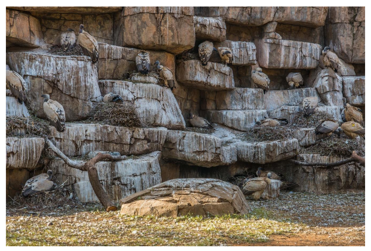
Figure 5: The artificial south-facing cliff designed for non-releasable breeding Cape Vultures.