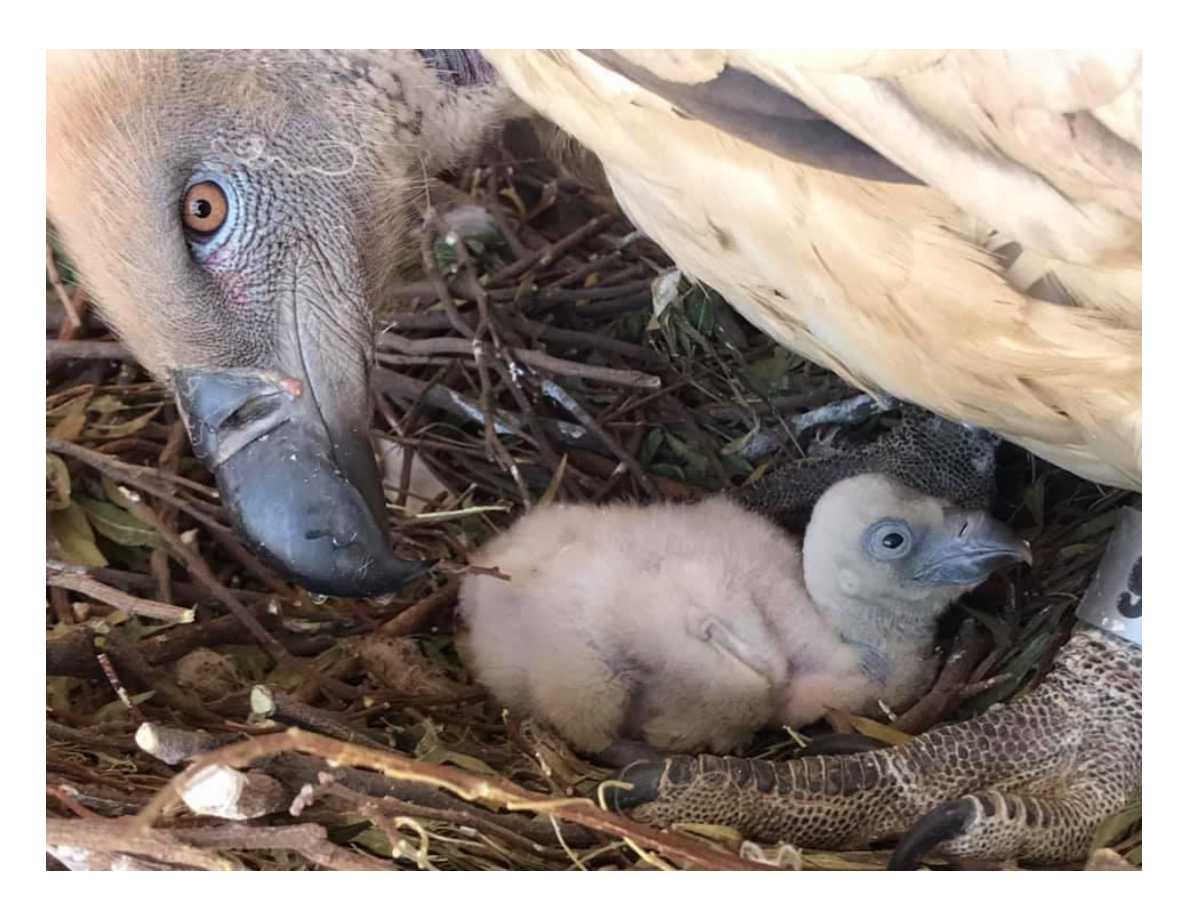
Figure 1: A Cape Vulture parent and chick in VulPro's captive breeding colony.